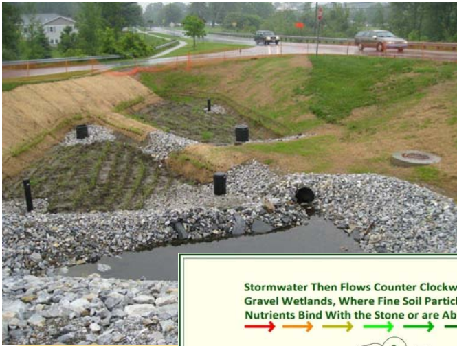
Completed treatment facility (June, 2010)

Treatment Graphic by Tony Stout (LEG) for Vtran Display