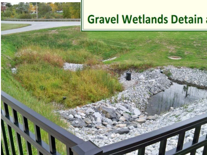
Mature wetland vegetation (September, 2010)